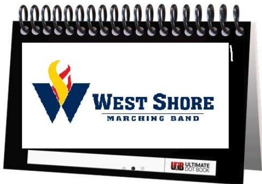
On the outside